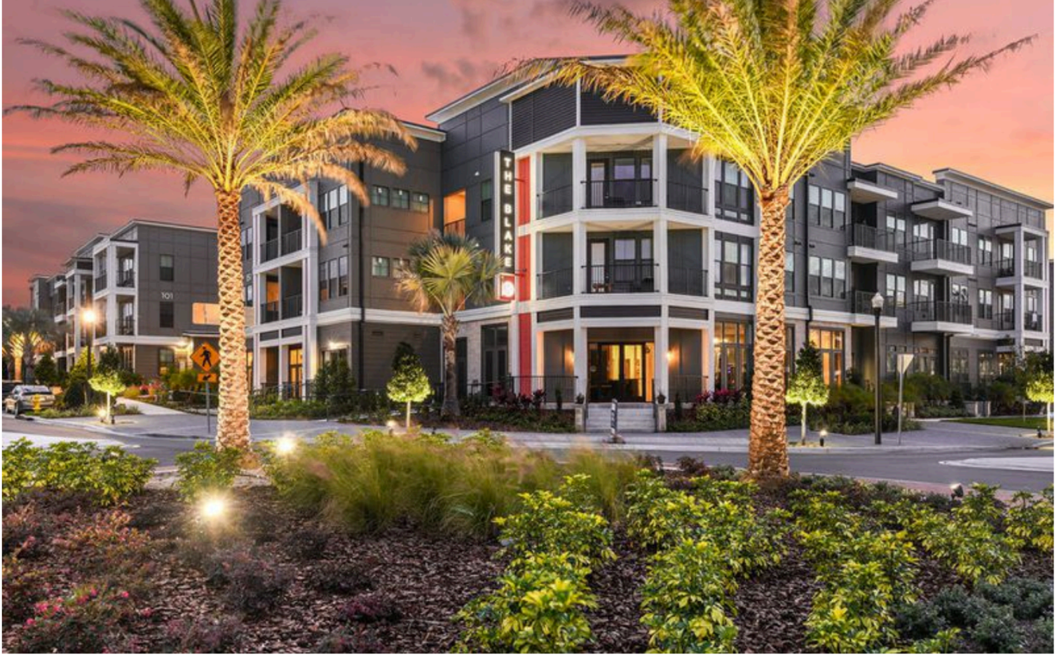
A 281-unit multifamily development by Catalyst called The Blake. The Winter Springs community is similar to what the developer is proposing to build at 6575 E. Colonial Drive.

Atlanta-based Catalyst Development Partners is looking to acquire a vacant site near Orlando's Baldwin Park neighborhood for its next apartment community in Central Florida.